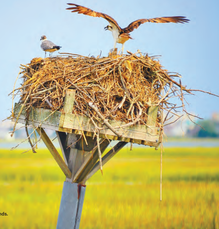
An osprey and a laughing gull in the Cape May County wetlands.

the bird blinds at the Nature Center of Cape May.