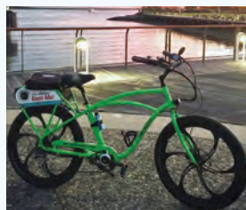
An electric two-wheeler from Pedego.

Bike to Go 174 Rehoboth Ave., Rehoboth Beach, (302) 227-7600,