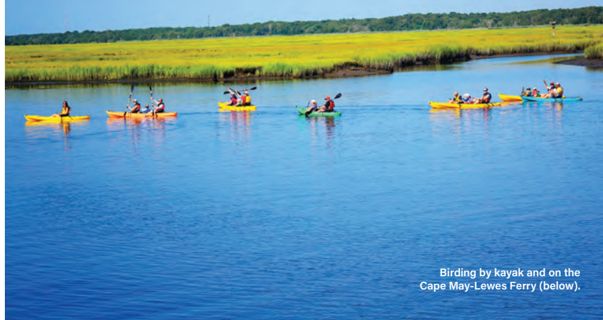
Birding by kayak and on the Cape May-Lewes Ferry (below).