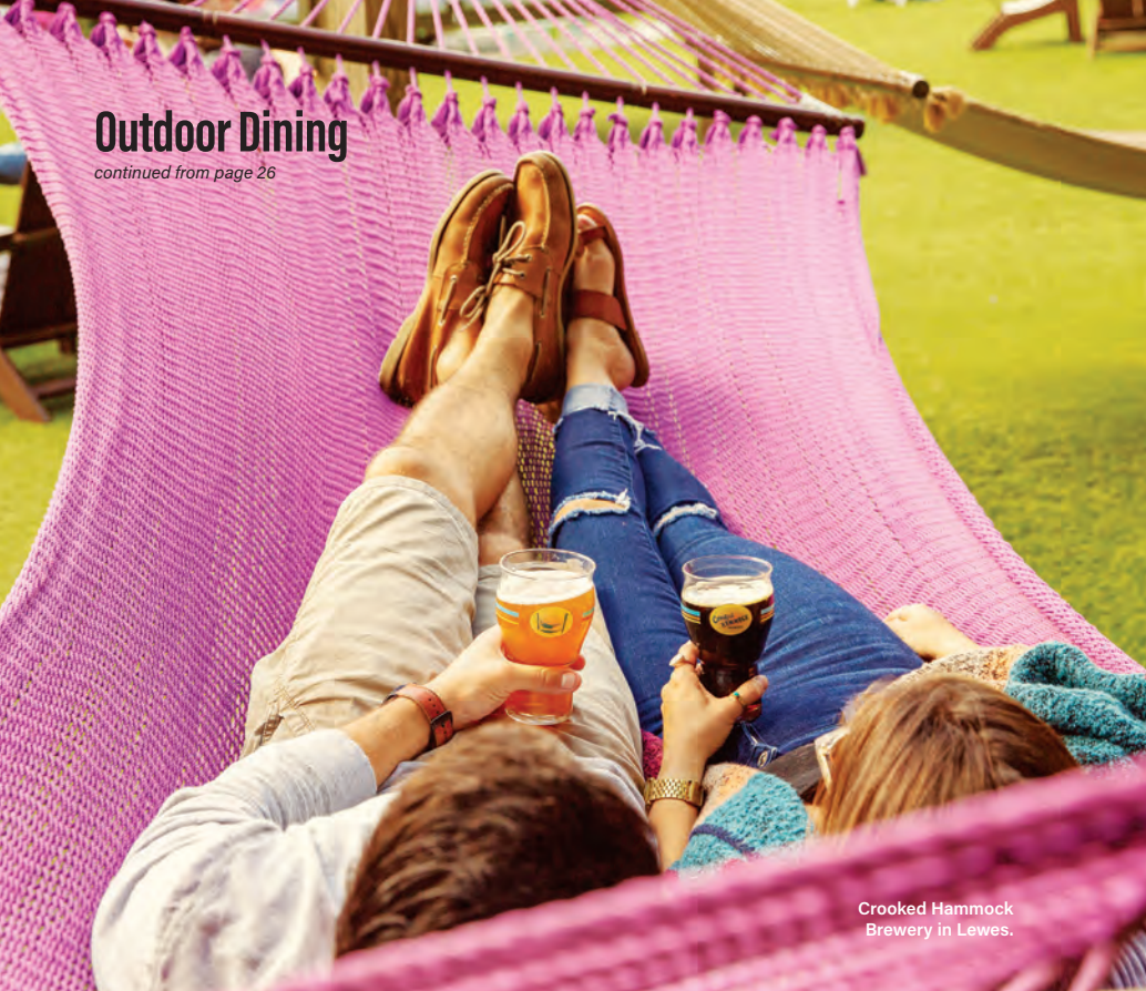
Crooked Hammock Brewery in Lewes.

You'd expect a dining spot with the name Fish On to do a mean seafood stew and fish and chips. But you'll also find delectable non-seafood specialties like short-rib stroganoff and Southern fried chicken. Dive into it all on the outdoor patio. $15-$34.