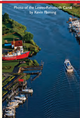
Photo of the Lewes-Rehoboth Canal

Stop in or call for a Visitor's Guide or a Historic Lewes Map