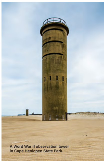
A World War II observation tower in Cape Henlopen State Park.

For a quick jaunt, take the sand-packed, 0.6-mile Salt Marsh Spur, the shortest trail in Cape Henlopen State Park. What it lacks in length, it makes up for in plant and wildlife