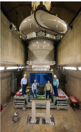
57 ft pump weighing 420 tons