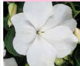
Super Elfin XP White