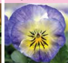
Sorbet XP 1988T