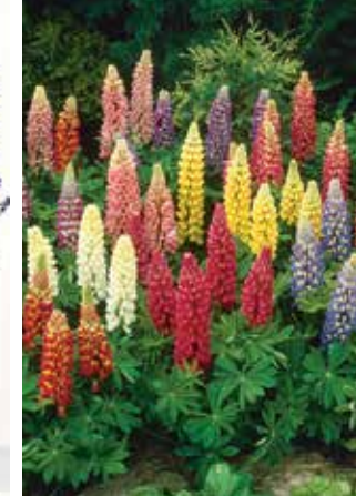
Lupins Gallery Mix