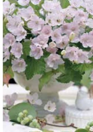
Delphinium Jenny's Pearl Pink