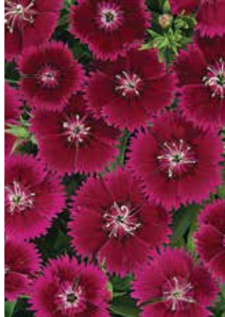
Dianthus Ideal Select Violet