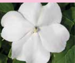
Accent Premium White