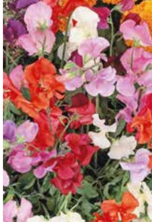
Sweet Peas Knee High Mix