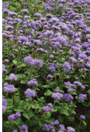
Ageratum High Tide Blue