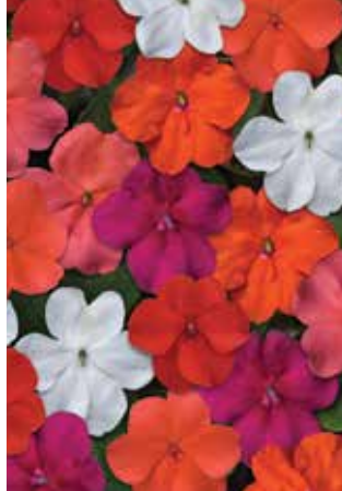
Beacon Select Mix