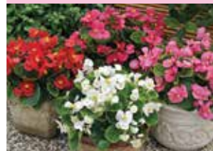
Begonia Bada Bing Series