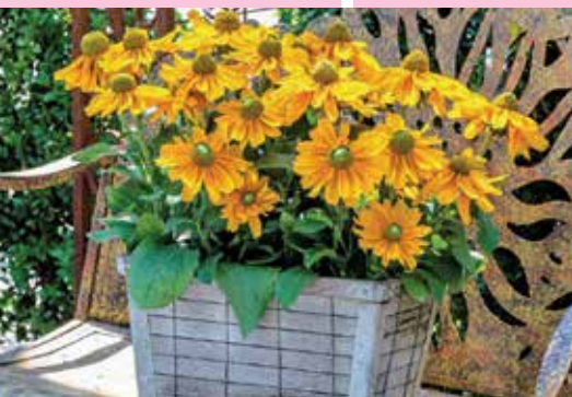
Rudbeckia Amarillo Gold