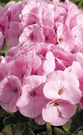
Geranium Bullseye Light Pink