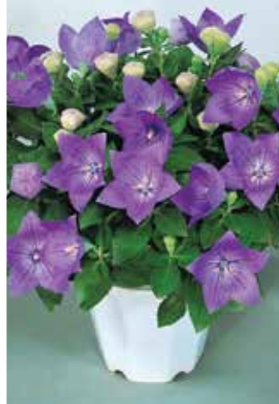
Platycodon Sentimental Blue