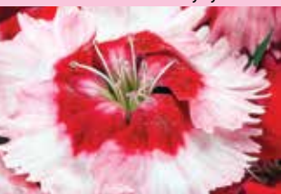
Venti Parfait Strawberry Shades