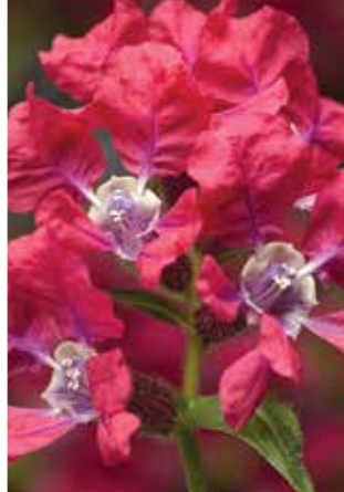
Cuphea Sriracha Rose