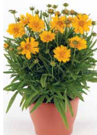
Coreopsis Double the Sun