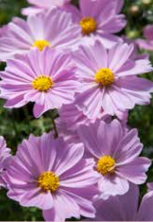
Cosmos Apollo Pink