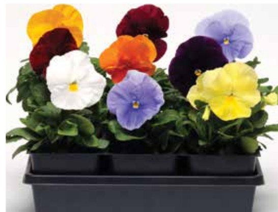
Spring Matrix Clear Mix

1145 Exhibition Mix Formula blend from the most popular European grown plain and blotched types. Pkt. (125 seeds) $2.75; 1/16 oz. $13.40; 1/8 oz. $21.95; 1/2 oz. $69.15.