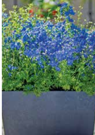
Delphinium Jenny's Pearl Blue