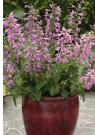
Summer Jewel Lavender