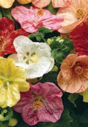
Abutilon Bella Select Mix