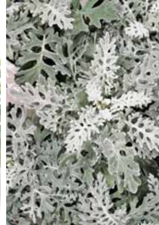
Dusty Miller Silverdust