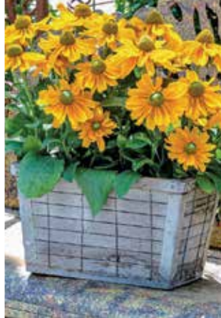
Rudbeckia Amarillo Gold