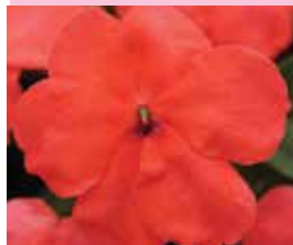
Super Elfin XP Salmon