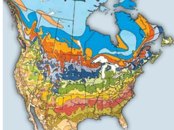
USDA Plant Hardiness Zones

Zone Map: Included in the index below are the approximate zones of hardiness for each perennial and biennial. Zone 3-6 = 3a-6b.