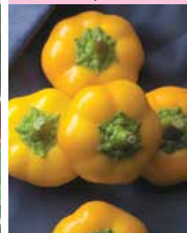
Yes to Yellow