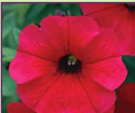
SuperCal® Royal Red Petchoa