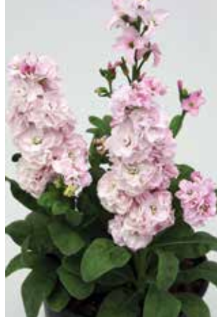
Stocks Mime Pink