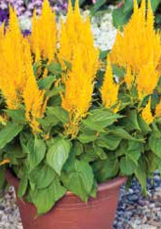
Celosia Bright Sparks Bright Yellow