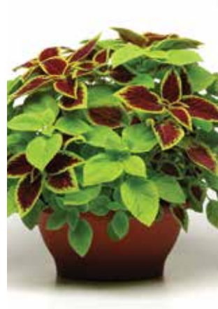
Coleus Under the Sun