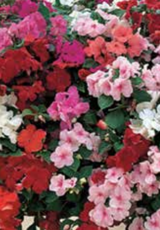
Accent Premium Mix