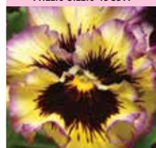
Frizzle Sizzle 1989J