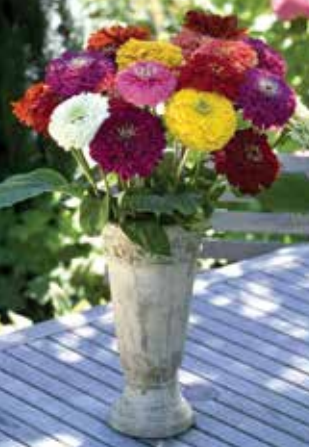
Benary's Giant Formula Mix