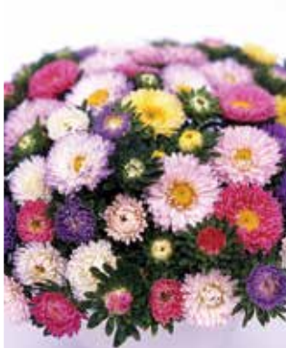
Aster Matsumoto Mix