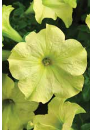
Petunia Sophistica Lime Green