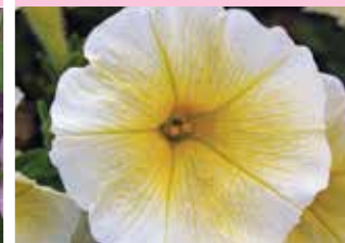
Easy Wave Yellow