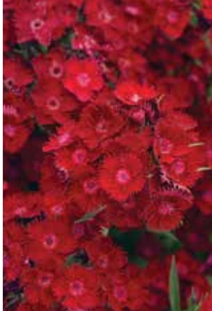
Sweet William Rockin' Red