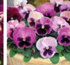
Spring Matrix 1738H