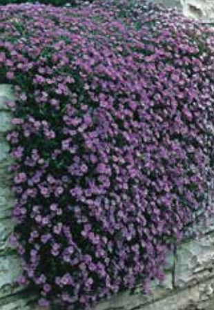
Aubretia Mixed Hybrids