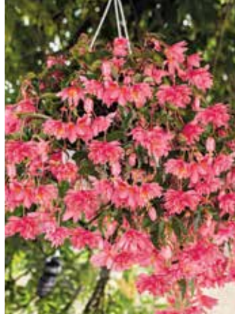
Begonia Funky Pink