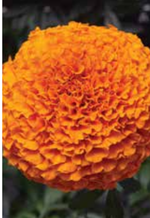
Inca II Deep Orange