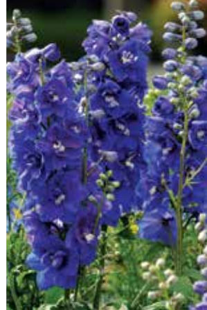
Delphinium Dasante Blue