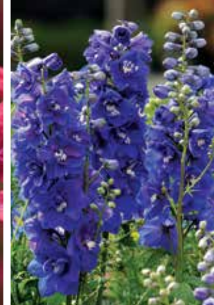
Delphinium Dasante Blue