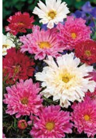
Cosmos Double Click Mix