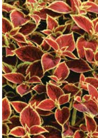
Coleus Crimson Gold