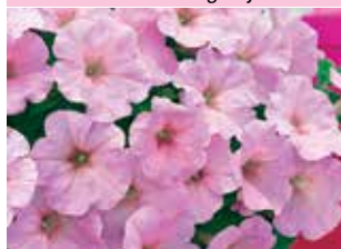
Trilogy Pink Lips