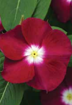
Mediterranean XP Burgundy Halo