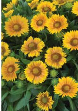
Gaillardia Arizona Apricot