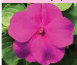
Accent Premium Lilac