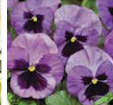
Spring Matrix 1738G