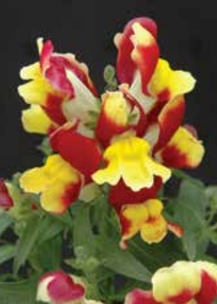
Floral Showers Red & Yellow Bicolor