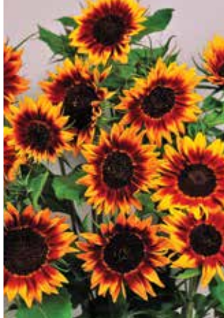
Ring of Fire