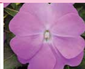
Divine Blue Pearl