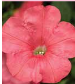
Petunia FotoFinish Salmon