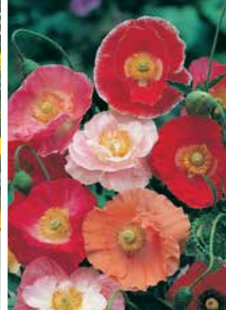
Poppy Shirley Mix