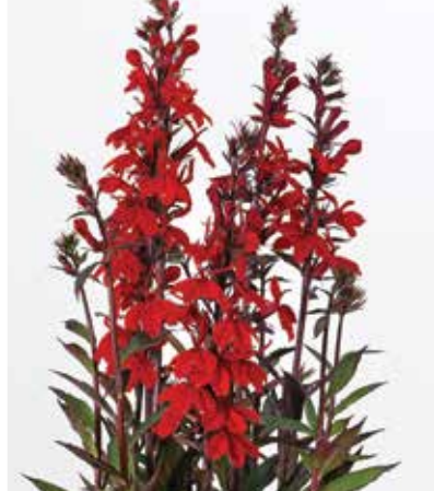
Lobelia Starship Scarlet/bronze leaf