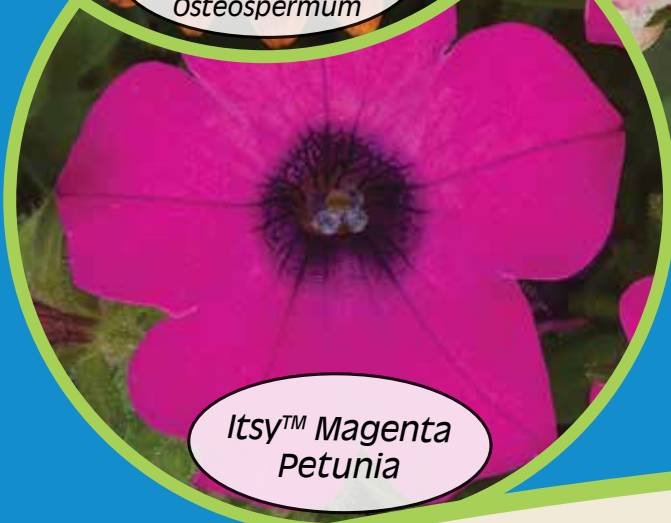
Itsy™ Magenta Petunia