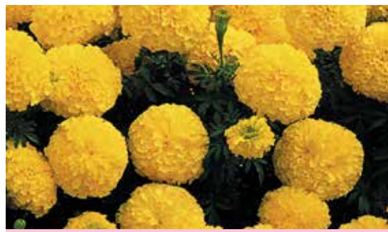
Inca II Primrose

1055 Crackerjack (35 in/89 cm) Popular O/P variety. Improved Super African, more fully double than the old favorite with the same yellow, orange and gold color range. Used by cut flower growers for summer production and fall harvests. When used in chicken feed, hens produce eggs with darker yolks because of the high color concentration in the blooms. Pkt. (75 seeds) $2.25; 1/4 oz. $3.60; oz. $6.40; 1/4 lb. $18.40; lb. $73.60.