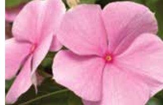
Cora XDR Light Pink