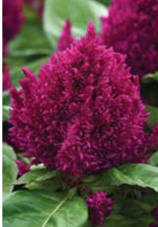
Celosia First Flame Purple