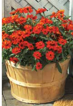
Zinnia Profusion Fire Bronze