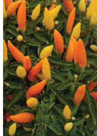
Capsicum Sedona Sun