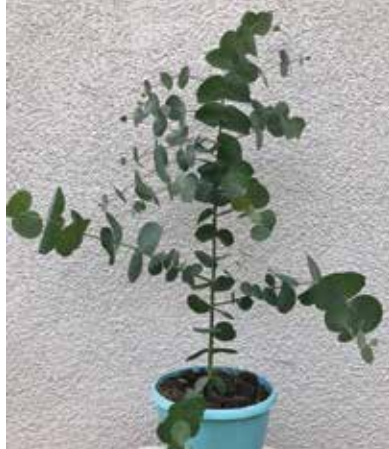
Eucalyptus Baby Blue