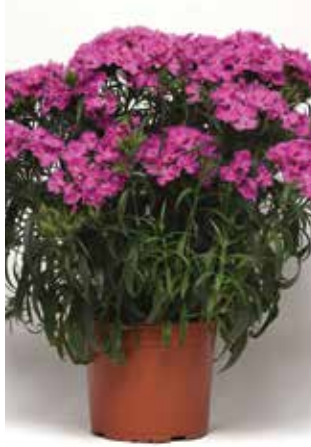
Sweet William Rockin' Purple