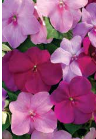
Xtreme Sapphire Mix