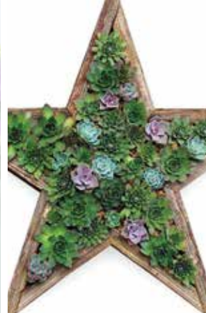
Succulents Hippie Chicks