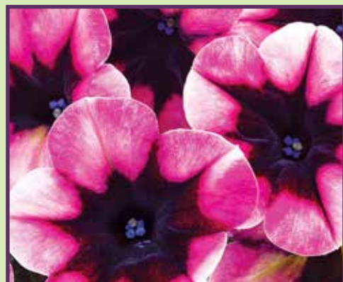
Crazytunia® Blackberry Jam Petunia