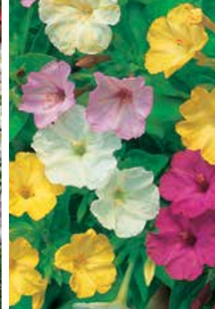
Marvel of Peru Mix