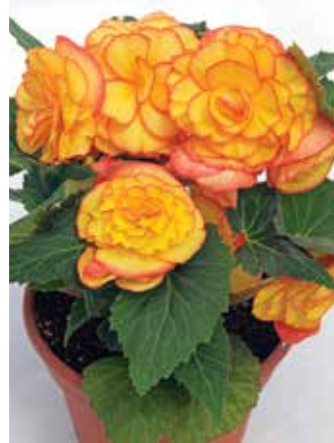
Begonia On Top Sun Glow