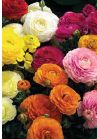
Ranunculus Maché Mix