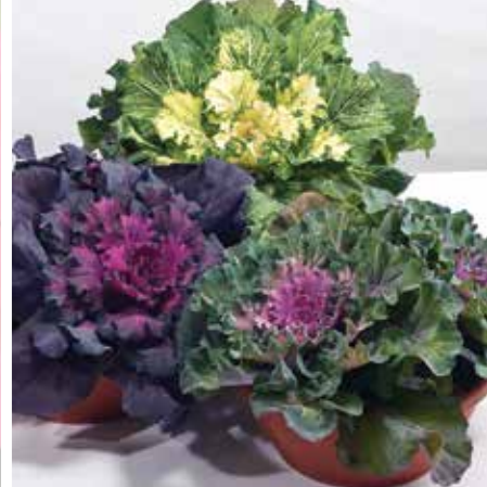
Flowering Cabbage Osaka Series