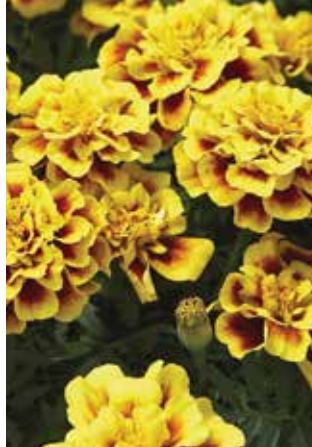
Safari Yellow Fire