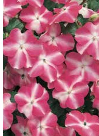
Accent Rose Star