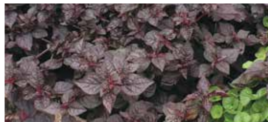
Iresine Purple Lady

P1899 Mini Mint An attractive, highly fragrant groundcover or small pot plant. Each multi-seed pellet contains 8-12 seeds, one plug in a 4 in/10 cm pot delivers a nice fast fill. Leaves are non-toxic but do not have a palatable flavor. Multi-pellets. Pkt. (10 pellets) $3.95; 100 pellets $19.40; 500 pellets $45.00; 1,000 pellets & over $83.66 per M.