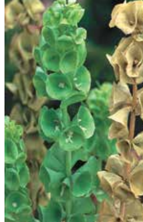
Bells of Ireland