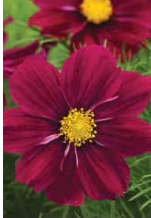
Cosmos Sonata Purple Shades