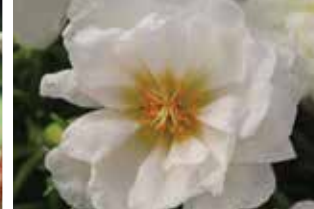
Portulaca Happy Hour Coconut