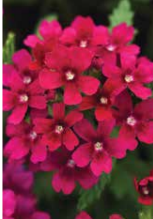
Verbena Quartz XP Bordeaux