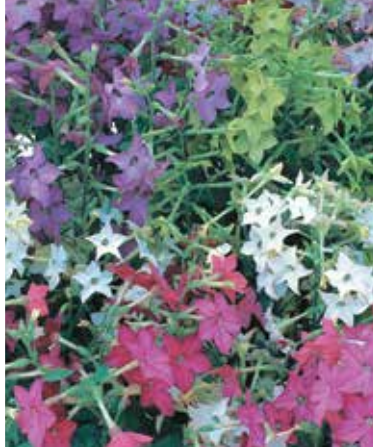
Nicotiana Perfume Mix