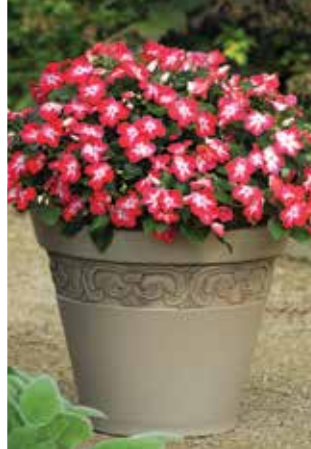
Super Elfin XP Red Starburst