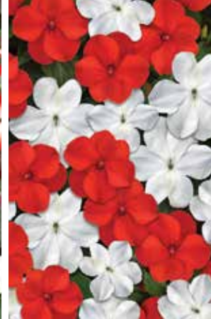
Beacon Red/White Mix