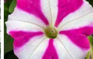
FotoFinish Rose Star