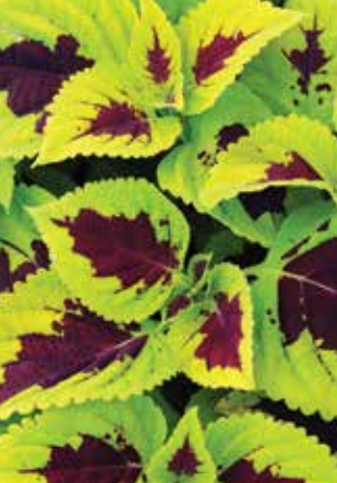
Kong Lime Sprite