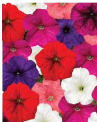
Petunia FotoFinish Mix