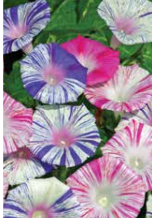
Morning Glory Venice Mix