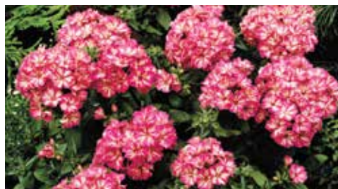
Phlox Grammy Pink & White

R1227A Grammy Pink & White (8-10 in/20-25 cm) F1 hybrid. The most compact phlox drummondii available. Free flowering bi-color blooms produce color all summer. Use in mixed containers, window boxes or gardens. Very uniform potted plant. 10-12 week crop. Primed Seed. Pkt. (20 seeds) $5.50; 500 seeds $66.20; 1,000 seeds & over $112.92 per M.