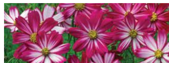
Cosmos Cosimo Red-White

865 Large Flowering Double Mix (3 ft/90 cm) Tall mix with double flowers. Used for cut flower production or bulbs. Extra large heavy blooms, should be staked. Pkt. (50 seeds) $2.50; 1,000 seeds & over $12.57 per M.