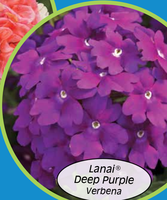
Lanai® Deep Purple Verbena