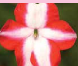
Imara XDR Orange Star