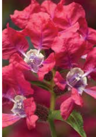
Cuphea Sriracha Rose