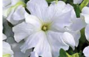
Tritunia Fresh White