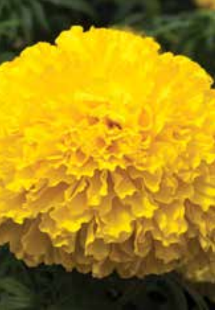
Big Top Yellow