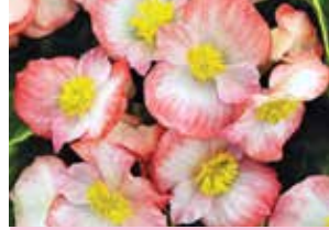
Sprint Plus Blush