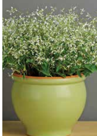
Euphorbia Glitz White