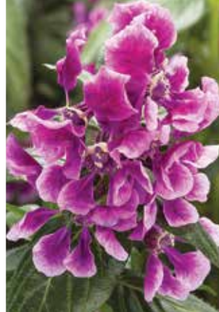
Cuphea Sriracha Lavender Bicolor