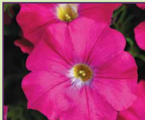
SuperCal® Rose Petchoa