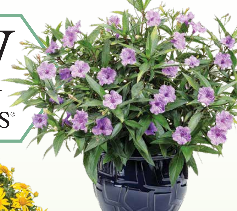
Machu™ Morado Mexican Petunia