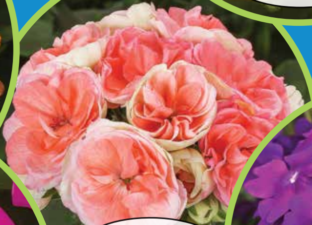
Rosalie™ Antique Salmon Geranium