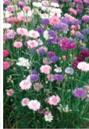
Centaurea Polka Dot Mix