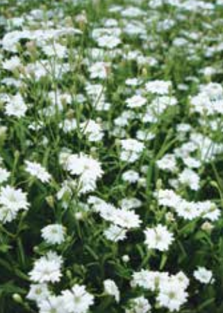
Silene Starry Dreams