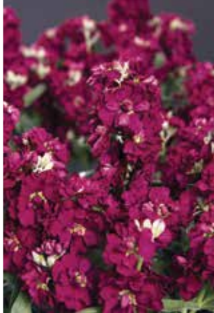
Stocks Vintage Burgundy