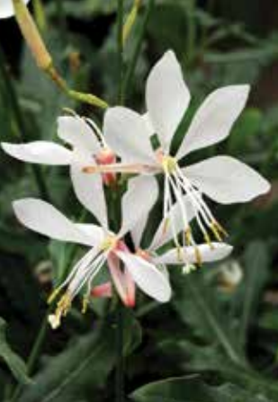
Gaura Sparkle White