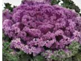
Flowering Kale Nagoya Rose