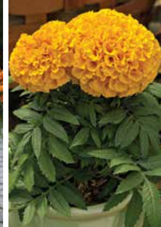
Proud Mari Gold