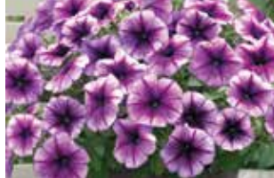
Trilogy Purple Vein