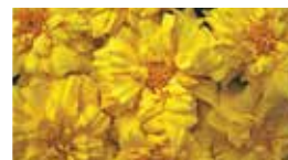
Zenith Lemon Yellow

Prices for Durango colors & mixes: Pkt. (25 seeds) $2.50; 1,000 seeds & over $11.99 per M.