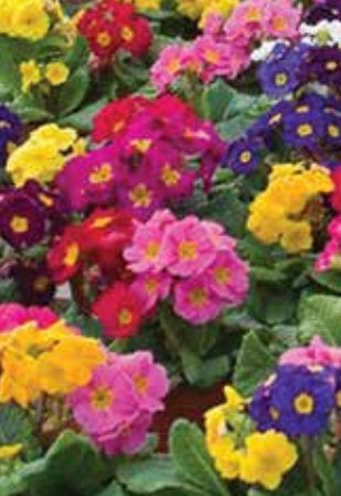
Primula SuperNova Mix