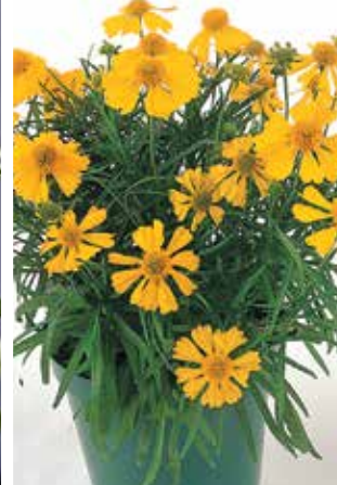
Helenium Dakota Gold