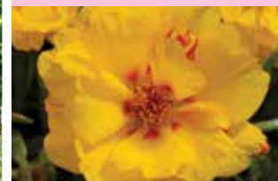
Portulaca Happy Hour Banana