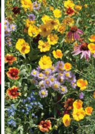
Bee Feed Wildflower Mix