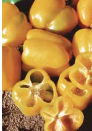
Yellow Belle II