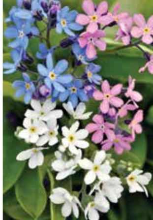
Myosotis Mon Amie Mix