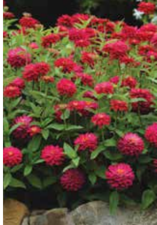
Zinnia Double Zahara Cherry