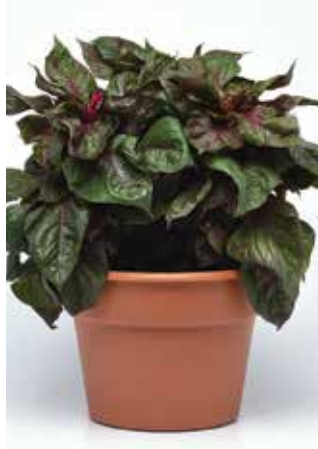
Celosia Sol Lizzard Leaf