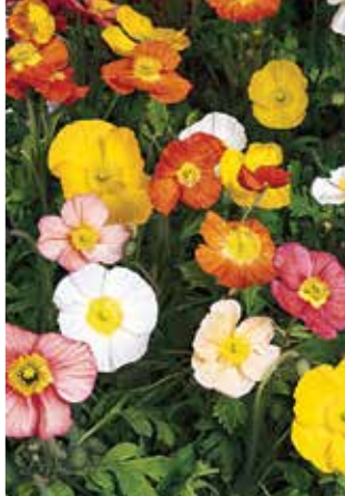
Poppy Champagne Bubbles Mix