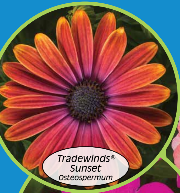
Tradewinds® Sunset Osteospermum

for vegetative materials from Burnaby Lake Greenhouses and Linwell Gardens Ltd.