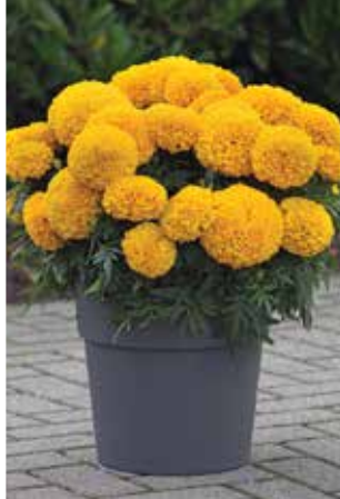
Marvel II Gold