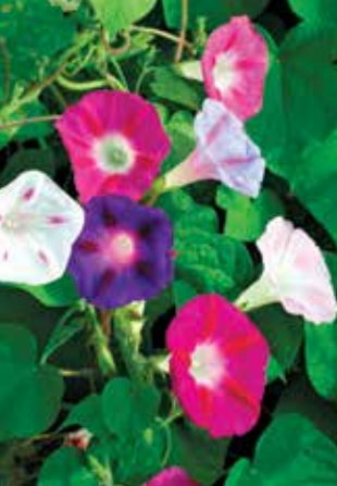
Morning Glory Mix