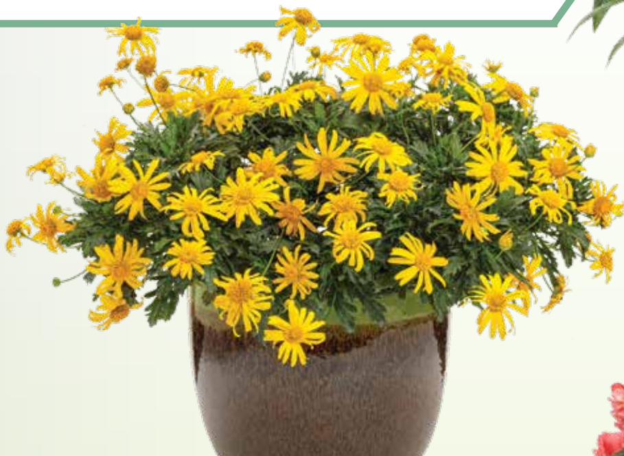
High Noon™ Bush Daisy