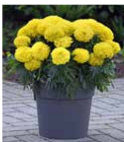
Marvel II Yellow