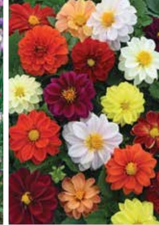
Dahlia Figaro Mix