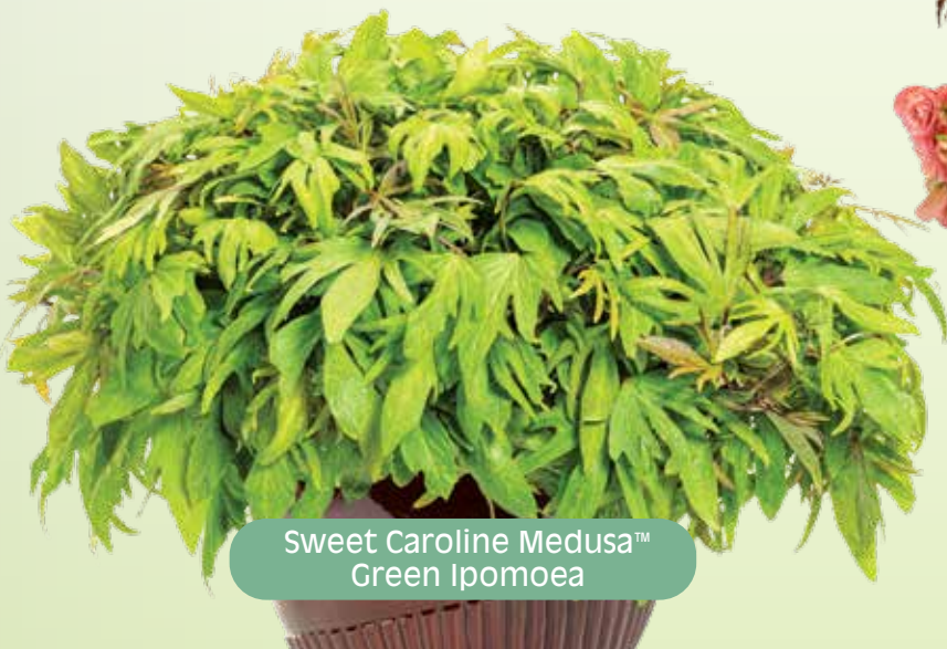
Sweet Caroline Medusa™ Green Ipomoea