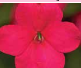
Imara XDR Rose