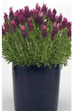
Lavender Bandera Deep Rose