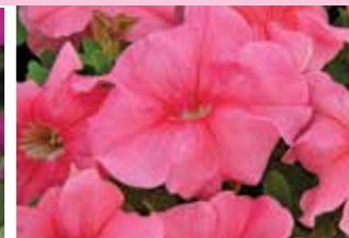
Limbo GP Peach