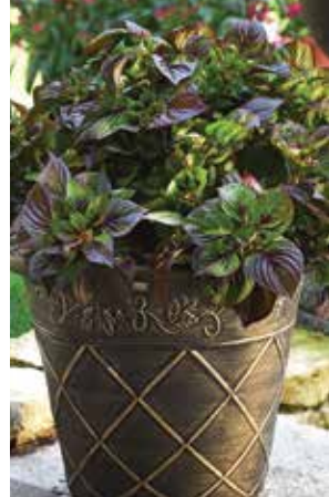
Celosia Sol Gekko Green