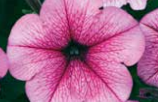
Easy Wave Rose Fusion