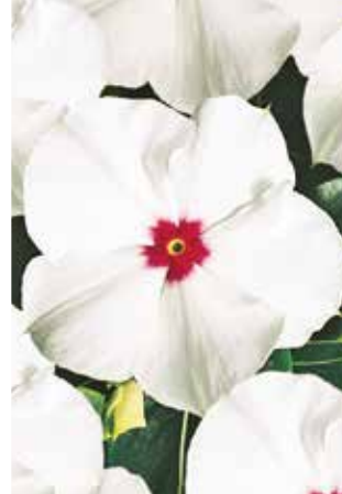
Pacifica XP Polka Dot