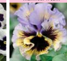
Frizzle Sizzle 1989D