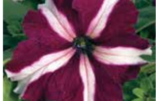
Tritunia Crimson Star