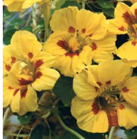
Nasturtium Peach Melba