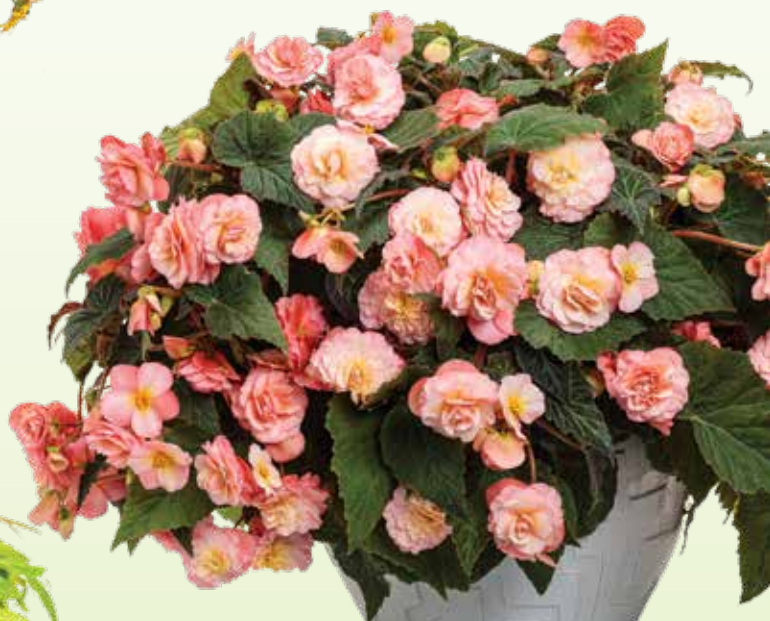
Double Delight™ Blush Rose Begonia