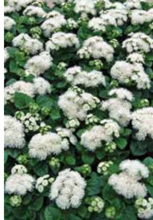
Ageratum Aloha White