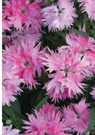
Dianthus Supra Pink