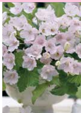
Delphinium Jenny's Pearl Pink