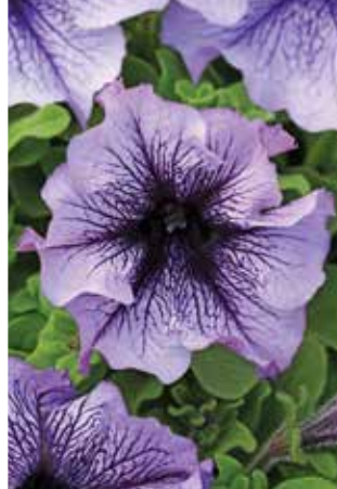
Petunia Daddy Blue