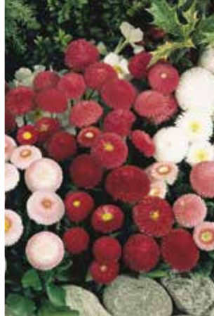
Bellis Perennis Tasso Mix