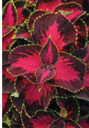
Coleus Chocolate Covered Cherry