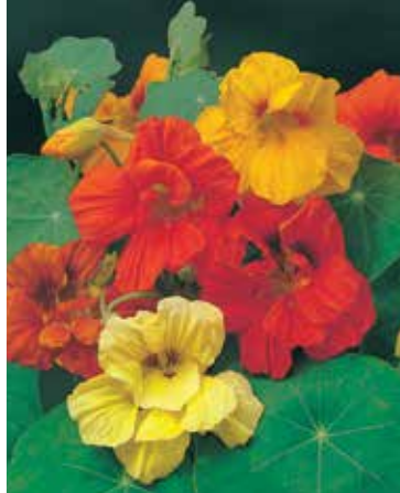
Nasturtium Whirlybird Mix