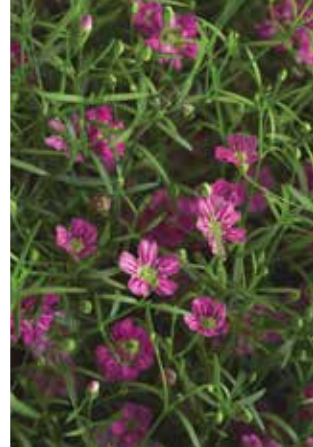
Gypsophila Gypsy Deep Rose