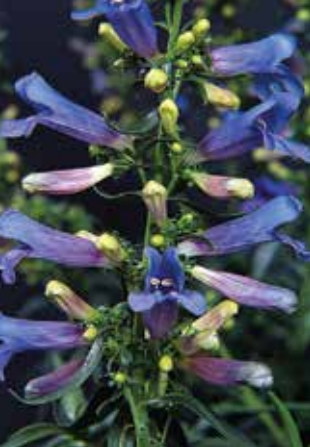
Penstemon Electric Blue