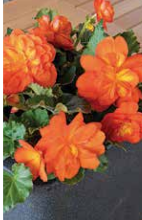
Begonia Nonstop Sunset