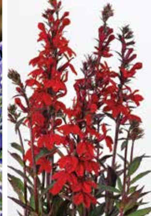
Lobelia Starship Scarlet/bronze leaf