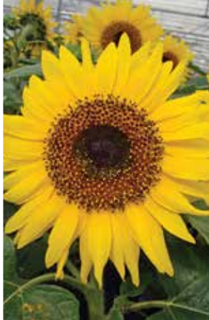
Helianthus Choco Sun