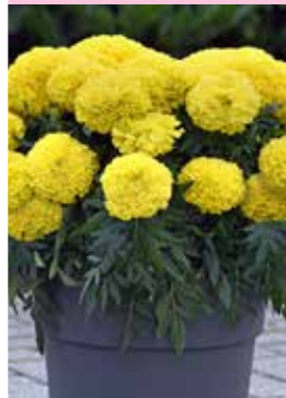
Marigold Marvel II Yellow