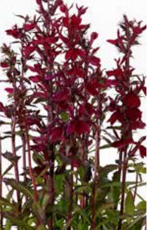
Lobelia Starship Burgundy