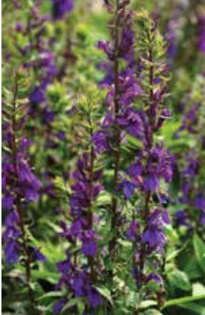
Lobelia Starship Blue