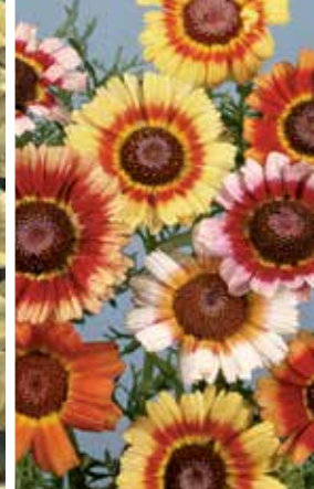
Single Annual Mix