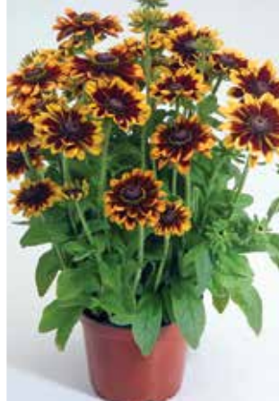
Rudbeckia Toto Rustic