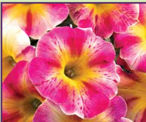
Crazytunia® Peach Bellini Petunia