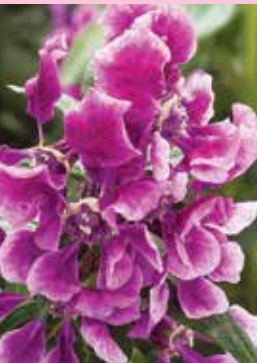
Sriracha Lavender Bicolor