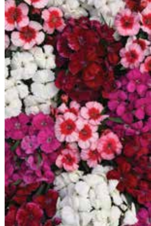
Dianthus Coronet New Mix