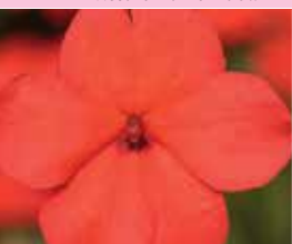
Imara XDR Orange