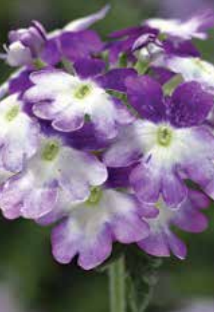
Tuscany Twister Purple Shades