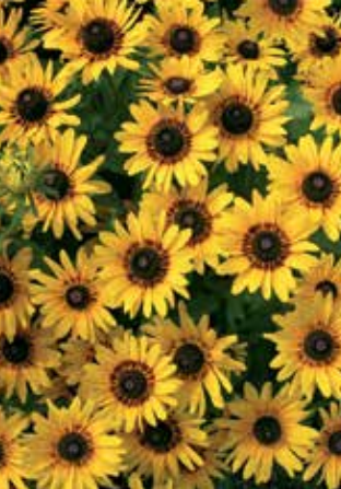
Rudbeckia Denver Daisy