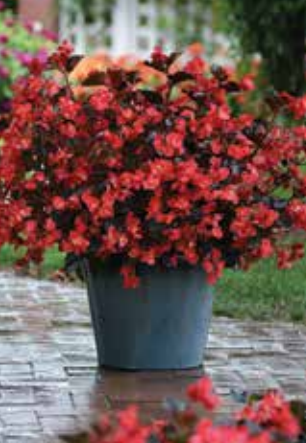
Megawatt Red Bronze Leaf