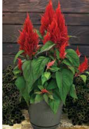
Celosia Century Salmon Pink