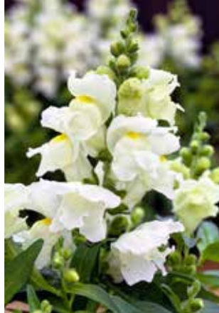
Candy Tops White