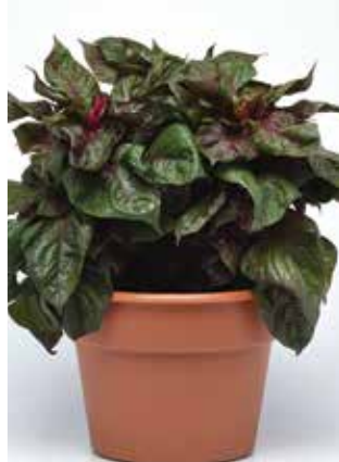
Celosia Sol Lizzard Leaf