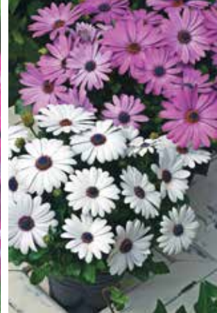
Osteospermum Asti Series