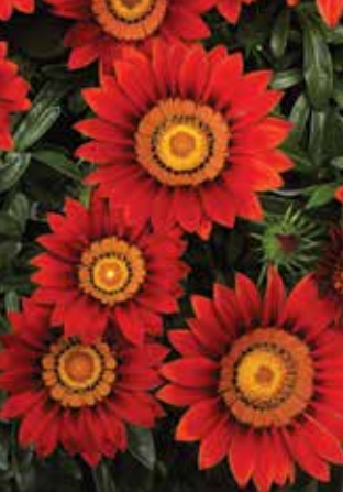
Gazania Big Kiss Red