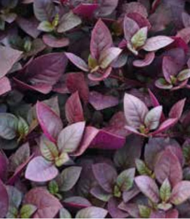
Alternanthera Purple Prince