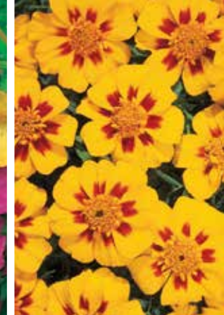
Marigold Disco Granada