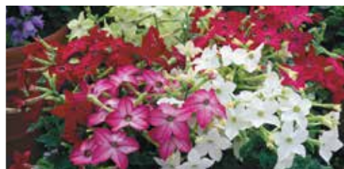
Nicotiana Saratoga Mix

1805 Oxalis Yellow (8-12 in/20-30 cm) Valdiviensis. Annual. Easy to grow. Nice green plant with clover type leaves and 2 in/5 cm golden yellow flowers that keep blooming from June to Sept. Use in flower beds as a border plant or for potted sales. Crop time approx. 50 days. Pkt. (80 seeds) $4.45; 1/4 oz $34.20; oz. $75.70.