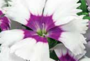
Venti Parfait Blueberry Eye