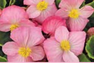
Begonia Sprint Plus Pink