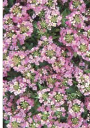
Alyssum Easter Bonnet Deep Pink