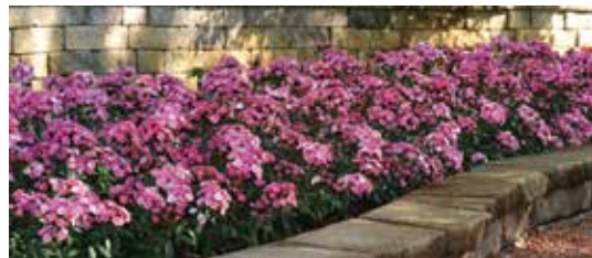
Dianthus Jolt Pink Magic

957A Satin Mix (8 in/20 cm) Blend of 8 colors. Pkt. (25 seeds) $4.50; 1,000 seeds & over $91.12 per M.