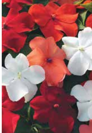
Xtreme Hot Mix