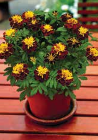
Super Hero Spry