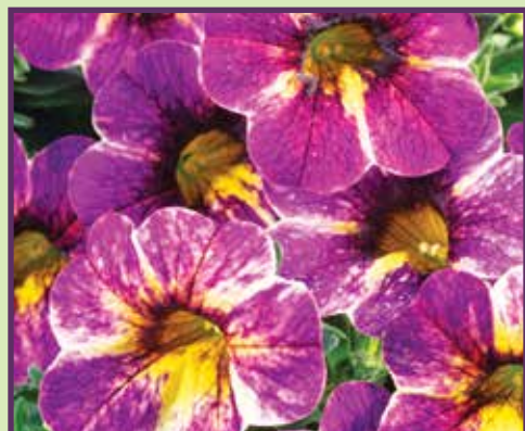
Chameleon® Blackberry Pie Calibrachoa