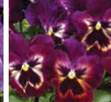
Spring Matrix 1738M