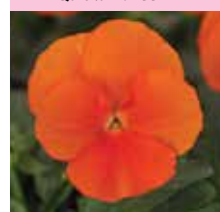
Sorbet XP 1988M