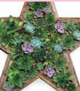
Succulents Hippy Chicks