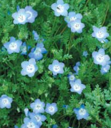
Nemophila Baby Blue Eyes