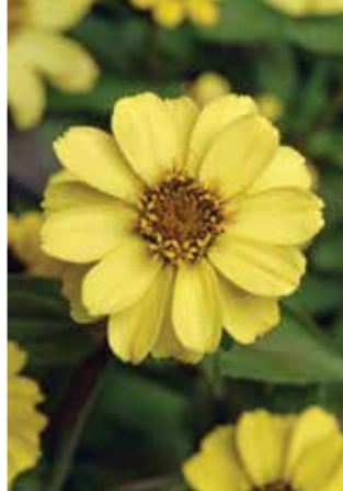
Zinnia Zahara Yellow