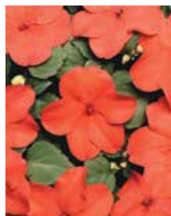
Super Elfin XP Punch