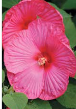
Hibiscus Luna Rose