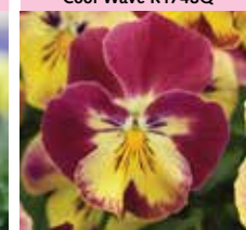
Cool Wave R1748R