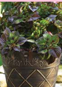
Celosia Sol Gecko Green