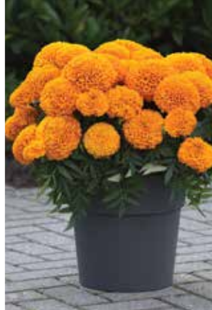
Marvel II Orange