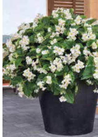
Begonia Big White Green Leaf