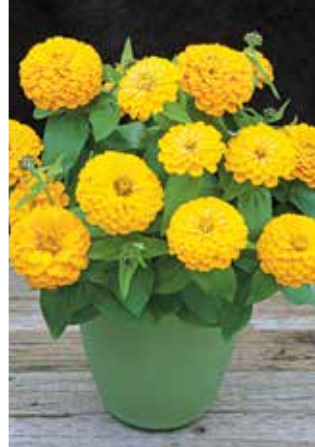
Zinnia Preciosa Yellow