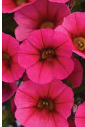
Calibrachoa Kabloom Cherry