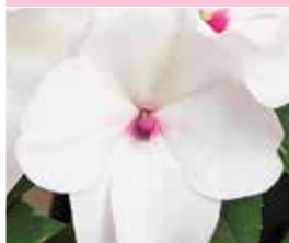
Accent Premium Bright Eye