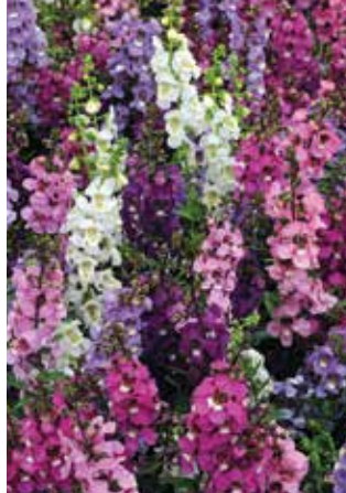
Angelonia Serena Mix