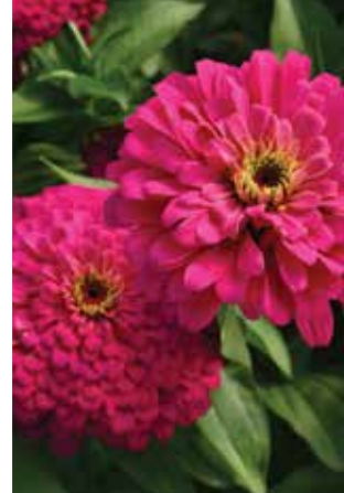
Zinnia Uproar Rose