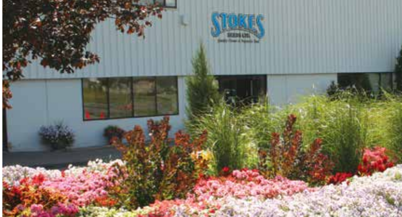
Thorold, Ontario - Head Office, Warehouse & Retail Store

Don't miss out and request your copy at www.stokeseeds.com or call 1-800-263-7233.