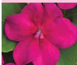
Beacon Violet Shades