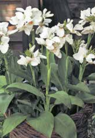
Canna Tropical White