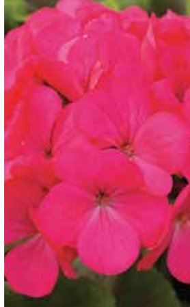
Geranium Maverick Rose