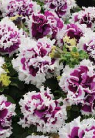
Petunia Double Pirouette Purple