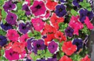
Limbo GP Picotee Mix