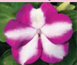
Accent Premium Violet Star