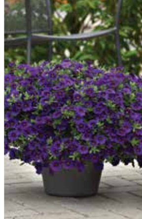
Calibrachoa Kabloom Blue