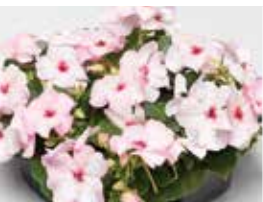
Xtreme Bright Eye

Prices for Xtreme colors & mixes: 50 seeds $5.20; 250 seeds $10.10; 1,000 seeds & over $26.88 per M.