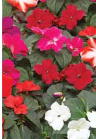
Imara XDR Mix