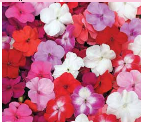
Super Elfin XP Mix

Prices of above Divine colors & mixes: 100 seeds $16.80; 1,000 seeds & over $85.85 per M.