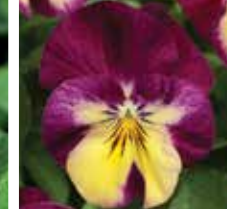
Cool Wave R1748Q