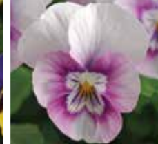
Sorbet XP 1987W