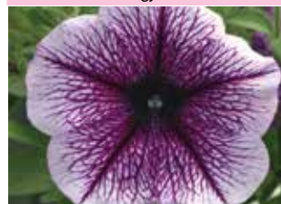
Opera Supreme Purple Vein