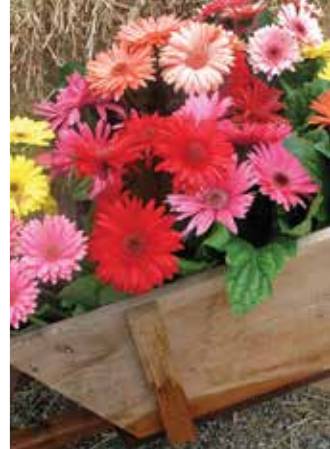
Gerbera Royal Premium Mix