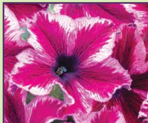
Crazytunia® Cosmic Pink Petunia