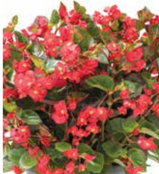
Begonia Viking XL Red on Green