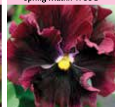
Frizzle Sizzle 1989B