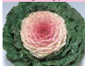
Flowering Kale Pigeon Victoria