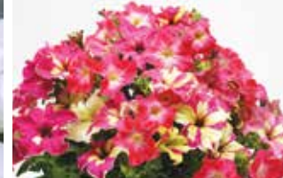
Fuseables Lime Coral