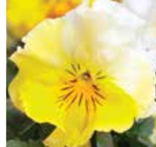
Frizzle Sizzle 1989H