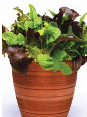
City Garden Mix