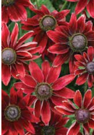
Rudbeckia Cherry Brandy