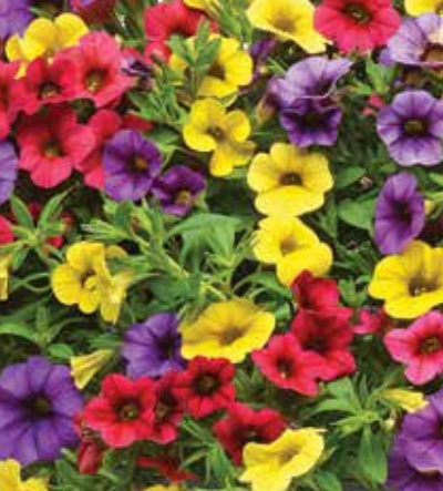
Calibrachoa Paradise Island