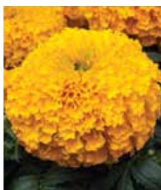
Big Top Gold