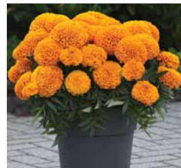
Marigold Marvel II Orange

VINCA - Tattoo Blueberry: Bold, fun and head turning this vinca's unique petals have an airbrushed look with soft strokes of black. Very floriferous and well-branched plants with an overlapping, fully round form that won't show gaps in hot temperatures. Outstanding color in hot, sunny conditions.