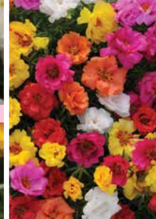
Portulaca Happy Hour Mix