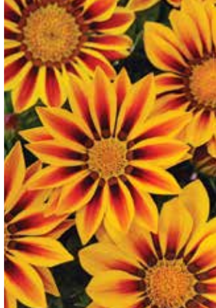
Gazania New Day Red Stripe