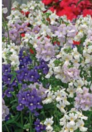
Nemesia Poetry Mix