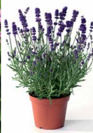
Lavender Scent Blue