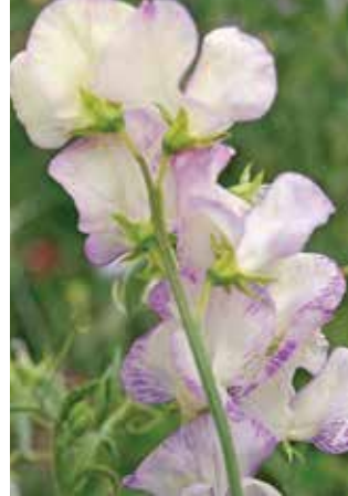
Sweet Peas High Scent