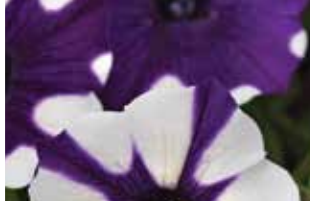
Shock Wave Purple Tie Dye