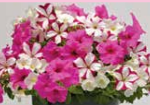
Fuseables Ooh La La