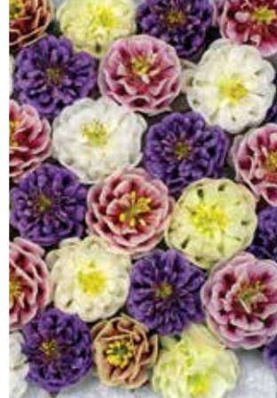
Aquilegia Winky Double Mix