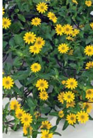
Sanvitalia Million Suns