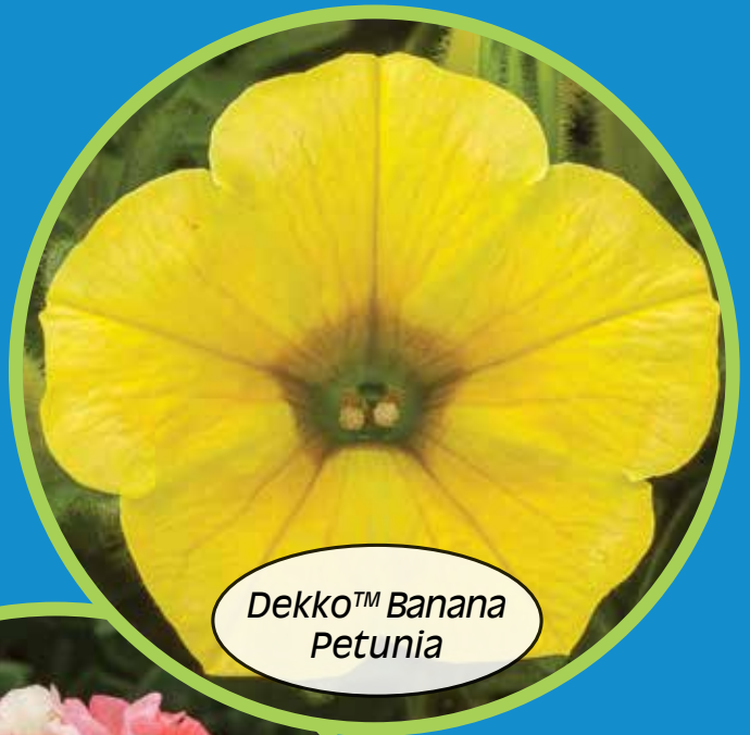
Dekko™ Banana Petunia