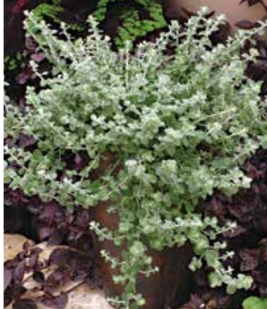
Helichrysum Silver Mist