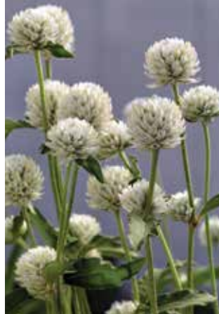
Gomphrena Ping Pong White