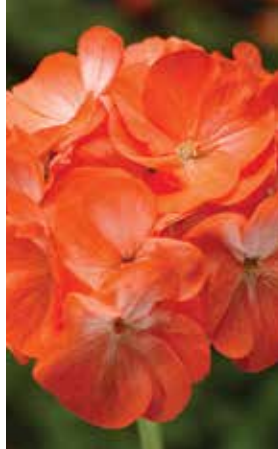
Pinto Premium Orange Bicolor