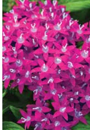
Pentas Lucky Star Raspberry