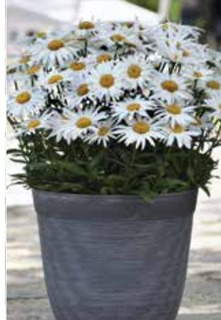
Leucanthemum Madonna White