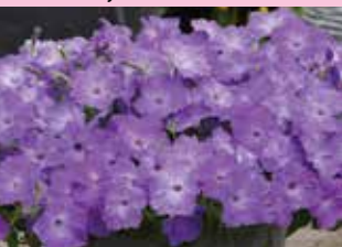
Easy Wave Lavender Sky Blue