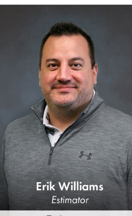
Estimator Award Recipient