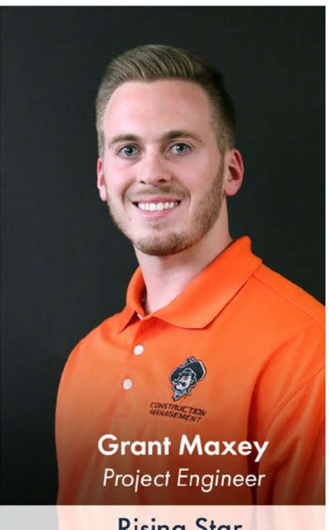
Rising Star Award Recipient