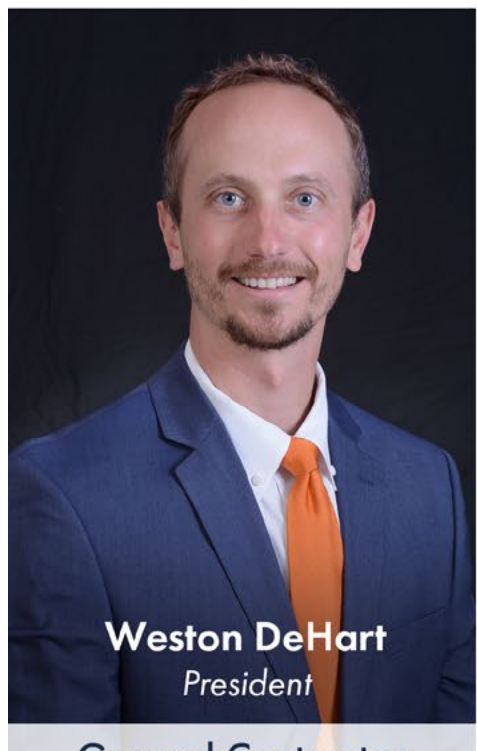
General Contractor Award Recipient