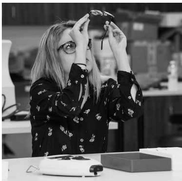
Students considering a career in optometry participate in the SEE at CCO program on the Downers Grove Campus.