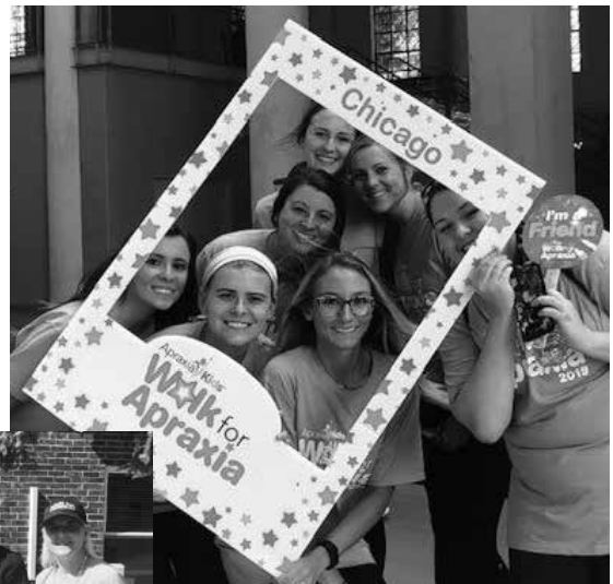
Speech-Language Pathology students participate in the annual Walk for Children with Apraxia.