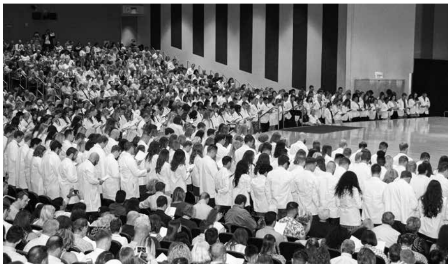
Midwestern University students participate in a White Coat Ceremony on the Glendale Campus.

Students who received their white coats also took an Oath of Commitment, reminding them to maintain the trust expected of a healthcare provider, to value the knowledge and wisdom of their colleagues, and to commit to lifelong learning. As they continue their rigorous academic programs, these students now join the many generations of alumni who also began their journey toward a successful healthcare career at Midwestern University.