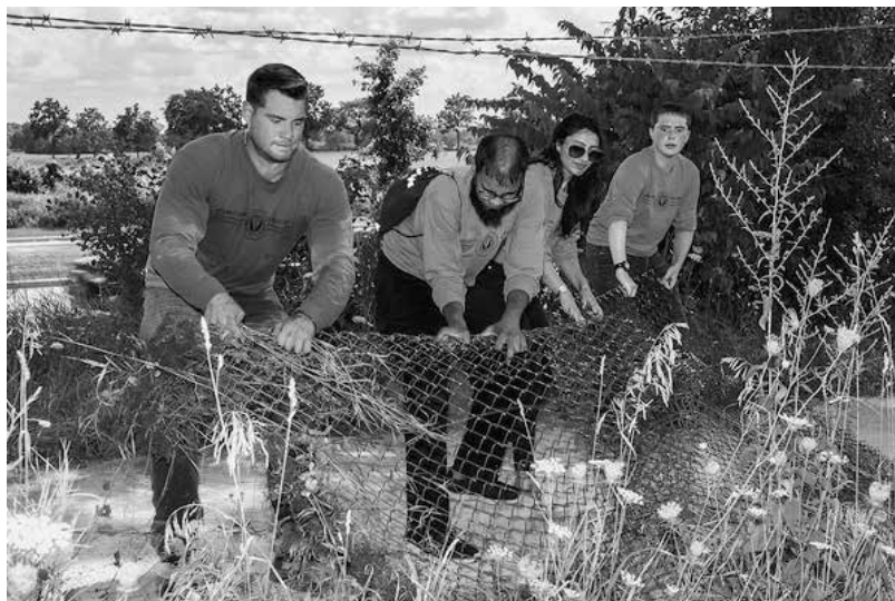
First-year CCOM students performed a variety of community service projects during orientation week.

During their orientation week, CCOM students also spent a day volunteering at local community organizations as a means to gain greater empathy and understanding about the community they will