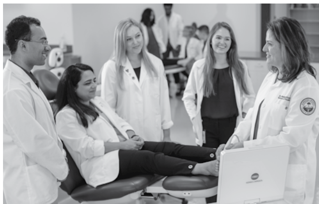
Students and faculty in the Arizona School of Podiatric Medicine try out their new lab.

A pair of new laboratory spaces is highlighting Midwestern University's commitment to providing students and faculty with cutting-edge resources for healthcare career education. The Arizona School of Podiatric Medicine and the Cardiovascular Perfusion Program at the College of Health Sciences each held open houses in September for the new lab spaces, which are designed to offer expanded training opportunities for students, faculty, and preceptors.