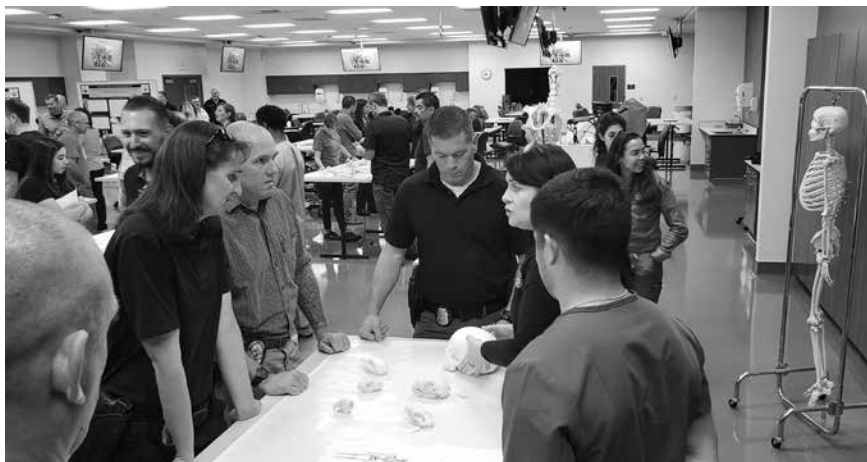
Law enforcement officials, MWU faculty, and student volunteers compare bone specimens during the bone identification lab.

Bone samples and photos from similar human and animal physiological structures were presented side-by-side for participants to identify, physically handle, and differentiate. Animal and human bone specimens were provided by the Department of Anatomy and the College of Veterinary Medicine, including new samples such as a bear foot and giraffe femur – both of which are extremely similar to their human analogues.