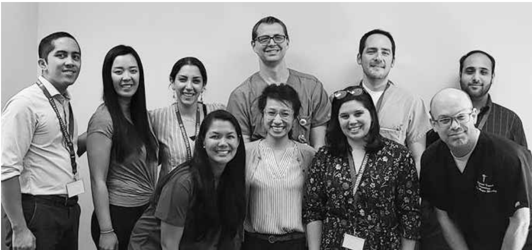
Chief Residents from Midwestern University-sponsored residency programs gathered at the Glendale Campus for a day of training and development.

Recently, the Midwestern University Osteopathic Training Institute (MWU-OPTI) hosted their first Chief Resident Training and Development Workshop.