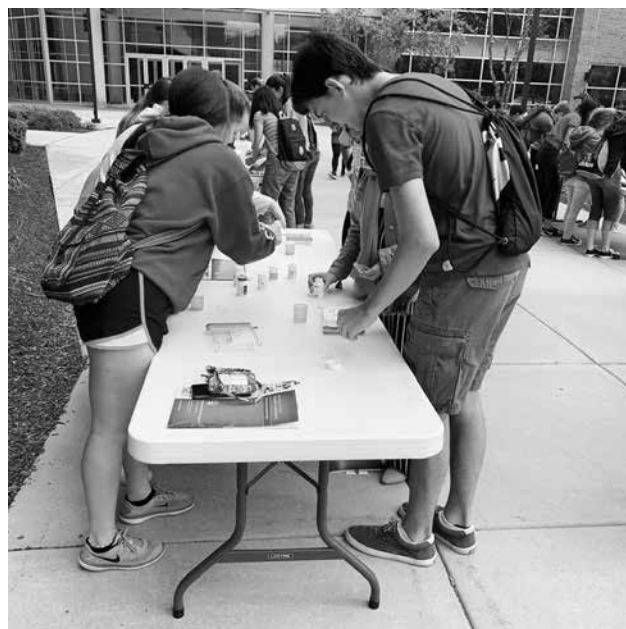
High school students visit the Downers Grove Campus to learn more about the pharmacy profession.

Arizona high schoolers spend eight days on the Glendale Campus participating in hands-on demonstrations of healthcare tools, techniques, and careers.