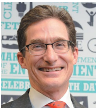
Ben Grumbles SECRETARY OF THE ENVIRONMENT