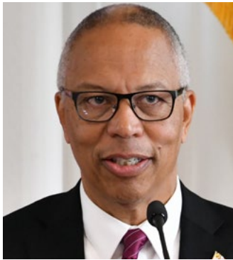
Boyd K. Rutherford LIEUTENANT GOVERNOR