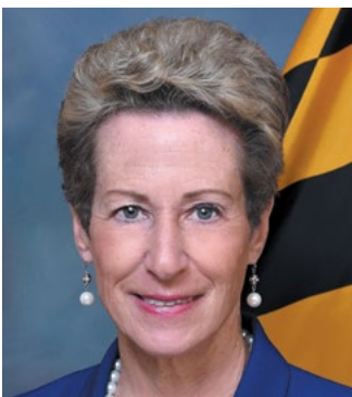
Karen Salmon STATE SUPERINTENDENT OF SCHOOLS