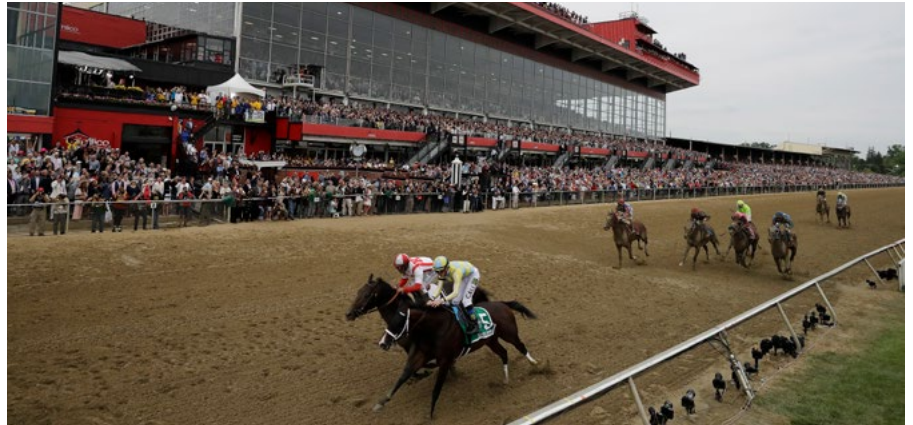
Keeping the Preakness Stakes in Baltimore has been a top priority for city political and business leaders.