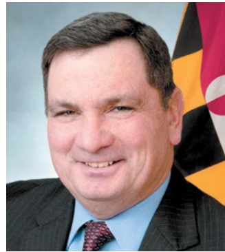
Joseph Bartenfelder SECRETARY OF AGRICULTURE