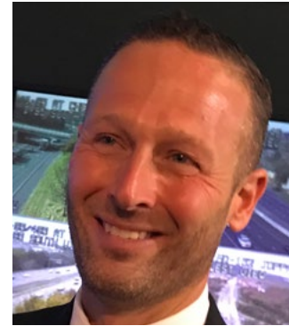
Greg Slater SECRETARY OF TRANSPORTATION