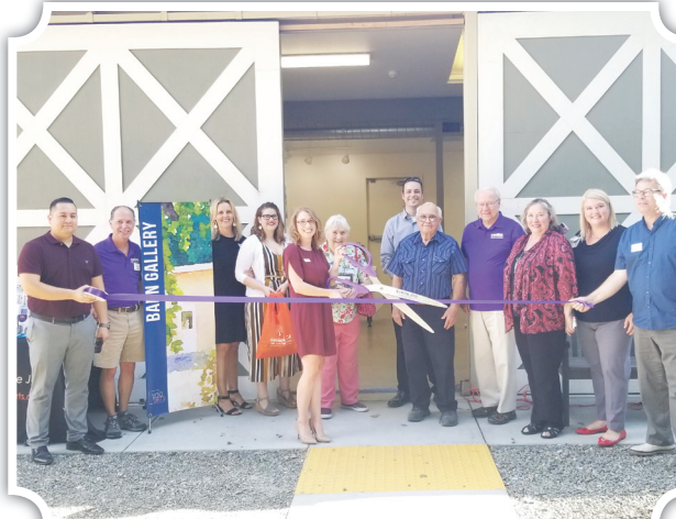
Yolo Arts Ribbon Cutting