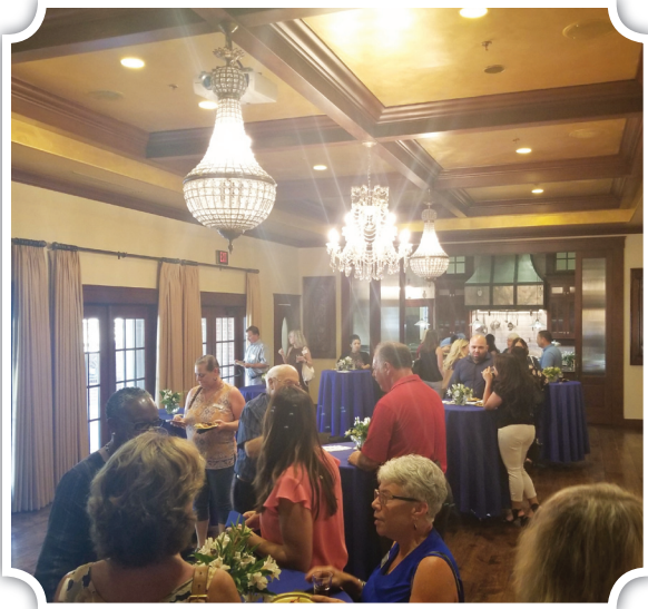
Lincoln Avenue & Luna Vista Rotary Club Monthly Mingle