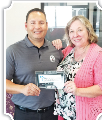
Yepez Real Estate