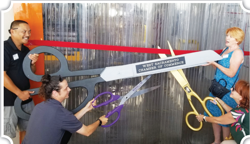
Yolo Food Bank Ribbon Cutting