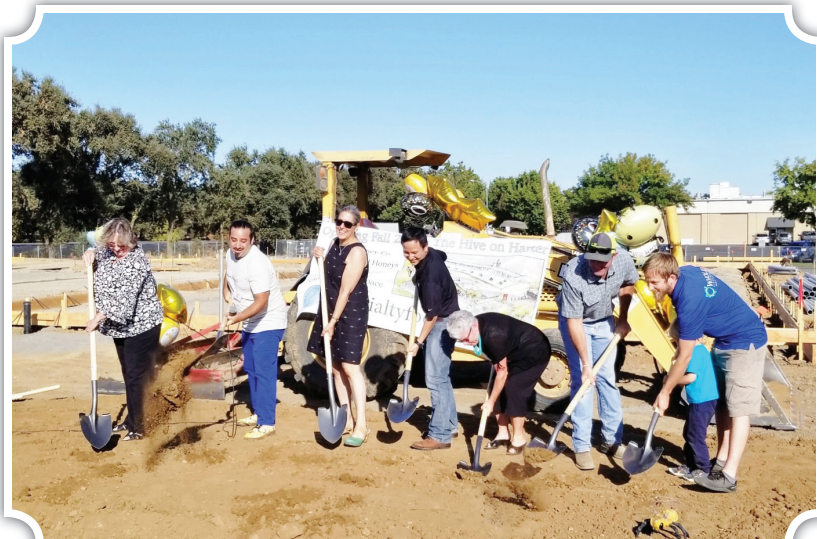
Z Specialty Ground Breaking "The Hive on Harter"