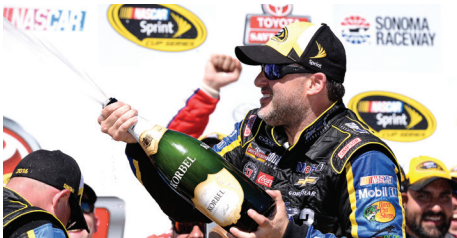
It's a champagne celebration for Tony Stewart in 2016.