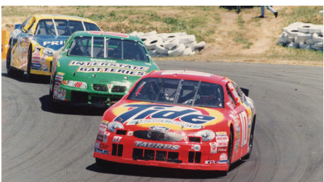
NASCAR driver Ricky Rudd drives the No. 10 Tide car at Sears Point Raceway.

“I called my crew chief and said, ‘guess what? I just got engaged, so now we can go out and win this race.’” And guess what? He did.