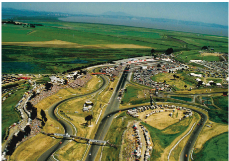
NASCAR drivers will tackle ‘The Carousel’ part of the road course for the first time since 1997 at this year’s Toyota/Save Mart 350.

“Winning at that place is really special,” he said. “That track is like a bottle of wine... you drink your first ever glass of wine and you know it’s not the best thing