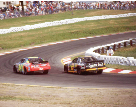
Jeff Gordon and Rusty Wallace battle it out inside “The Carousel” at Sears Point Raceway in 1995.

“That race I won in 2008 has to be one of my favorite memories,” he said. “And then in 2015, too. Being able to win just five races after coming back from the injuries (broken right leg and left foot) I sustained at Daytona that year and being able to get in Victory Lane in one of the toughest, most grueling races I feel I have ever been in, was really something.”