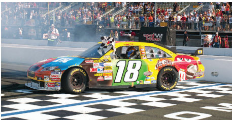
Kyle Busch slides over the start/finish line after his Sonoma win in 2008.

Oct. 7, 1995: Sonoma hosts its first NASCAR Truck Series race, which is won by Ron Hornaday Jr. May 4, 1997: After finishing second in 1990, 1995 and 1996, Mark Martin wins his first NASCAR Cup race in Sonom. June 28, 1998: The first race with the modified course using The Chute instead of the Carousel. The modification cut the 2.52-mile configuration to a 1.49-mile course. June 25, 2006: Jeff Gordon captures his fifth NASCAR Cup win in Sonoma, a track record. June 24, 2007: Juan Pablo Montoya becomes the first rookie to win a NASCAR event in Sonoma and the third foreign-born driver to win a NASCAR Cup race. June 22, 2008: Kyle Busch earns his first NASCAR Cup Series road-course victory and Toyota’s first victory on the Sonoma Valley road course. June 21, 2009: Kasey Kahne takes the checkers, earning his first NASCAR Cup Series road-course victory and the first victory since 1999 for team owner Richard Petty.