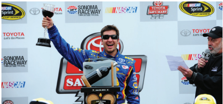
Toyota’s Martin Truex Jr. hoists the Champion’s Goblet in Wine Country Winner’s Circle in 2013.

For his part, Truex, who notched his first win with JGR at Richmond in April, feels fortunate to be able to continue doing what he loves with such a well-respected organization.