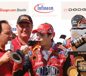
Jeff Gordon sips from the Champions Goblet in 2006.

June 28, 2015: Kyle Busch claims his second Sonoma victory on the way to his first Cup Series championship. June 26, 2016: Tony Stewart claims the last victory of his historic Cup Series career