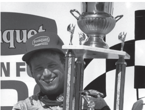
1989 trophy celebration with Ricky Rudd.