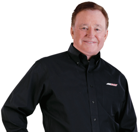
NASCAR Hall of Famer Richard Childress will take part in a pre-race Q&A with fans, June 23.