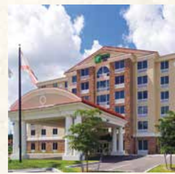
HOLIDAY INN EXPRESS & SUITES FORT MYERS

Book early and save with great value and great service!