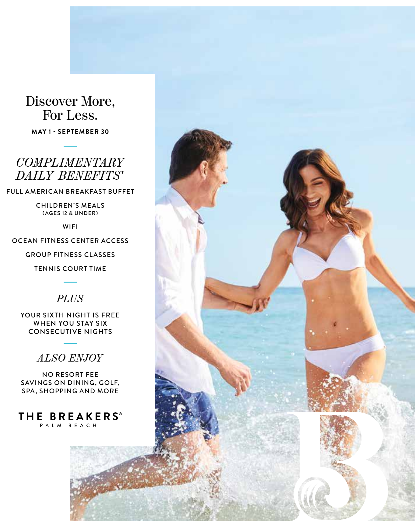
^{\star} Offer valid May 1 - September 30, 2019, including holidays, with prevailing rack rates. Not applicable to groups. Restrictions may apply.