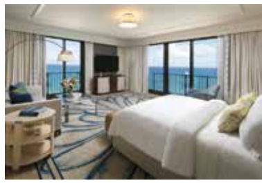
▲ The resort's guestrooms and suites offer guests a piece of paradise.