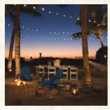
SOUTH SEAS ISLAND RESORT

Plan your next meeting at South Seas Island Resort, where not all meetings happen in a boardroom!