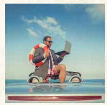
SUNDIAL BEACH RESORT & SPA

A Sanibel beach resort boasting 23,000 square feet of Gulf-front meeting space, capable of accommodating up to 300 guests.