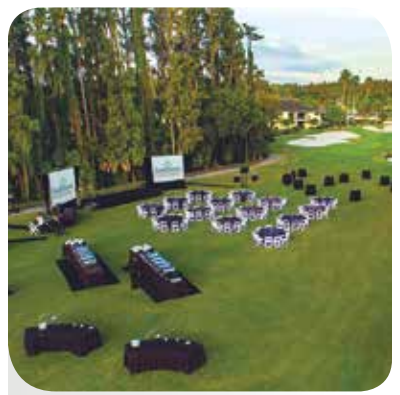
SADDLEBROOK The Perfect Meeting Venue