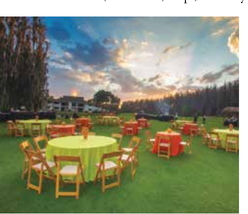
18th Fairway Dinner

Saddlebrook was designed to host meetings and to be the perfect venue for your next event. With Saddlebrook's convenient Walking Village layout, your accommodations are just steps from meeting rooms, function space, recreation, restaurants, shops, and every amenity. Cobblestone pavers in the