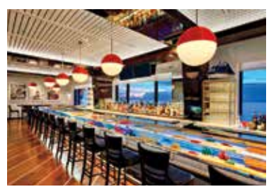
Seafood Bar is one of the most popular dining destinations on the island.