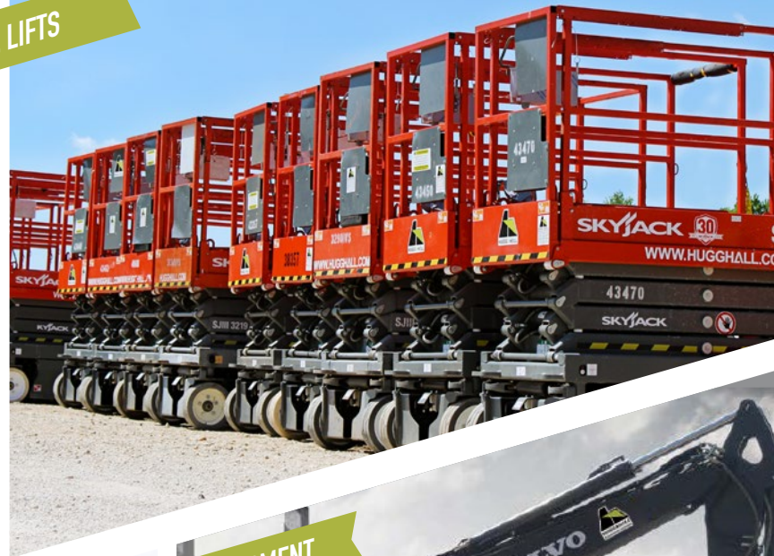
LIGHT CONSTRUCTION EQUIPMENT