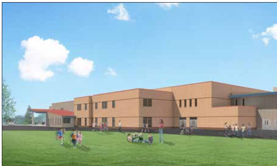
Kraus-Anderson was recently awarded a contract to manage a $93.9 million project that includes this expansion of Hudson High School, 1501 Vine St. in Hudson, Wisconsin.

District voters passed three separate bond questions in April to pay for the project, including $74.3 mil-