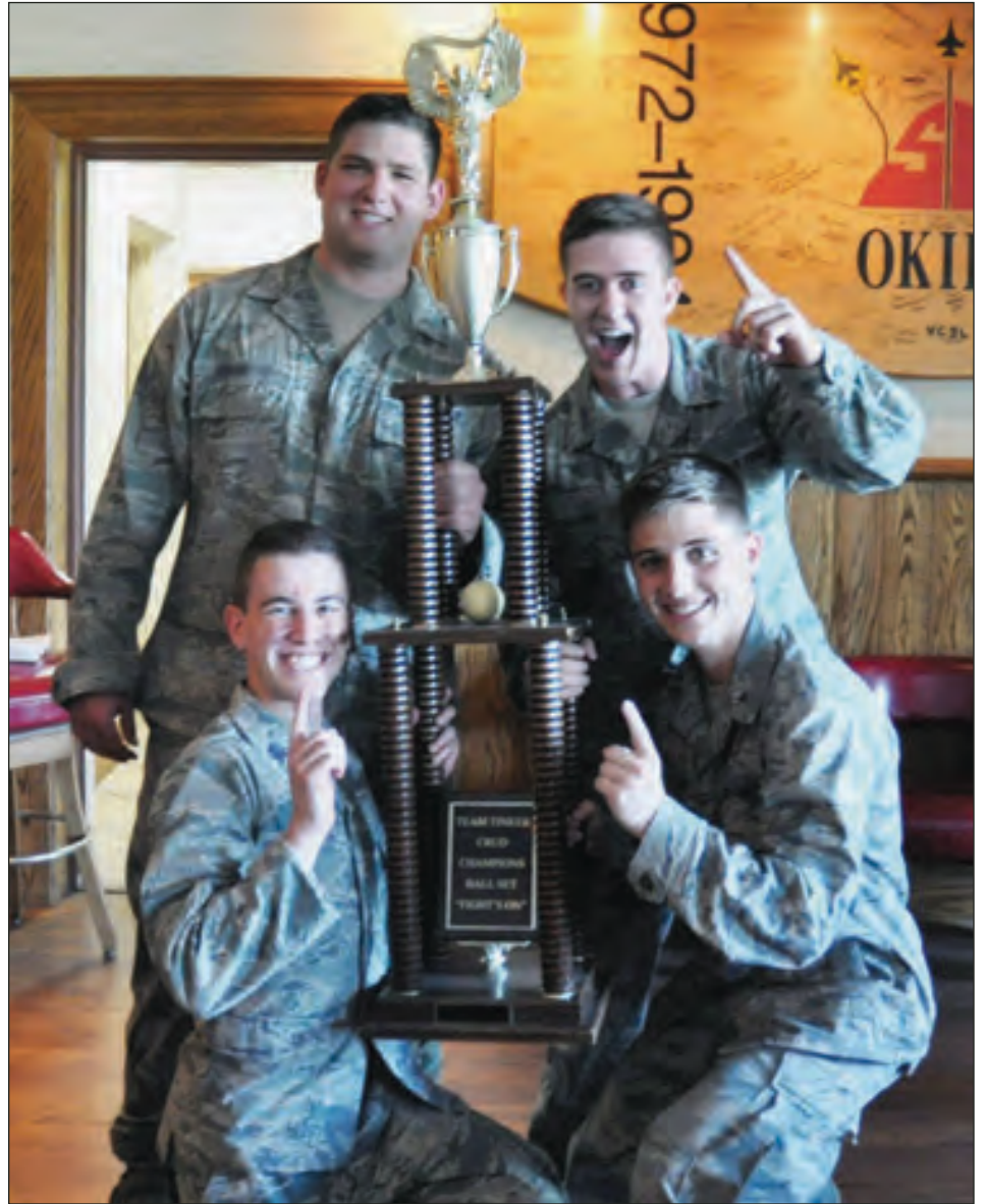
June Crud Champions

For more information about specials, events, and membership call the Tinker Club at 405-734-3418 or visit TinkerLiving.com/Club .